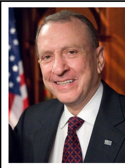
The CHA and Resident leadership of the past two decades mourns the passing of US Senator Arlen Specter.

Sen. Specter's efforts on behalf of the CHA were instrumental in its turnaround. The CHA has lost a great friend.